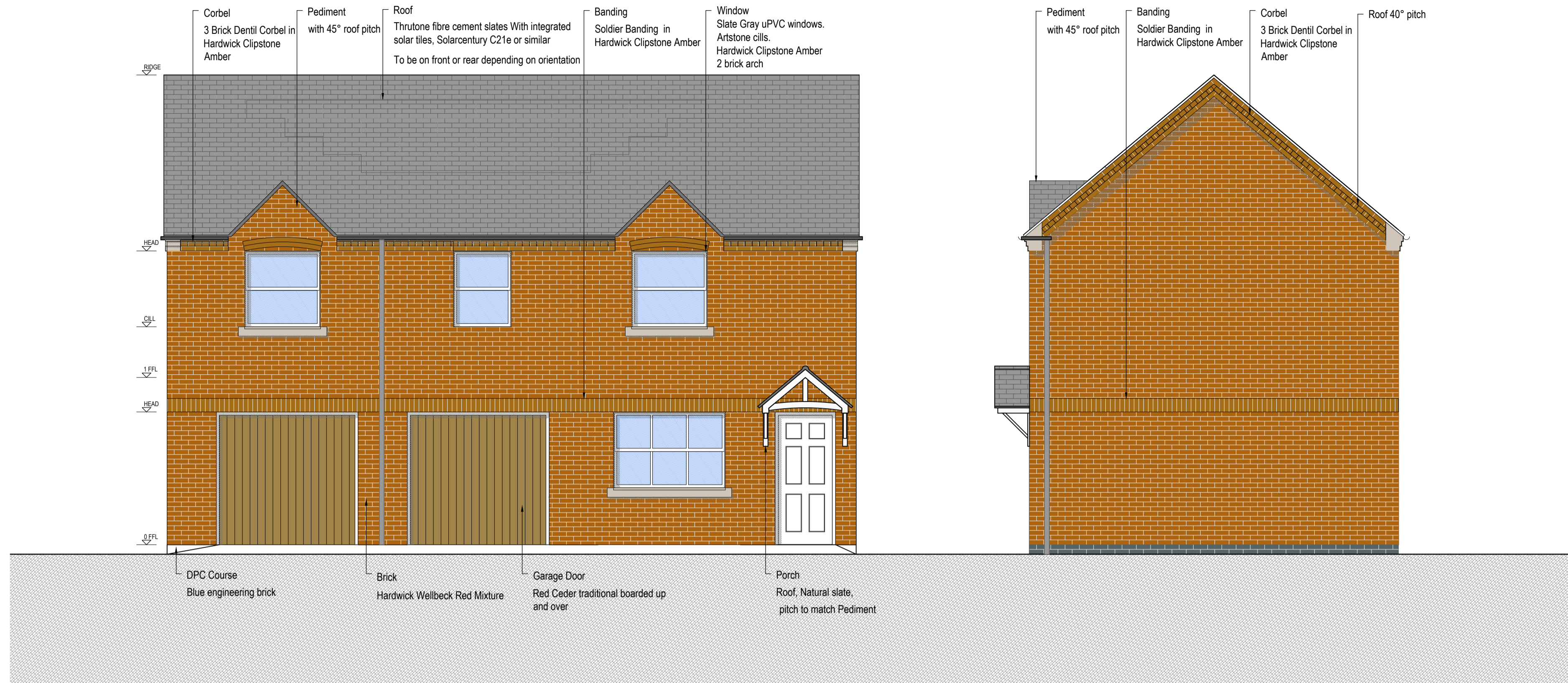
A Front Elevation